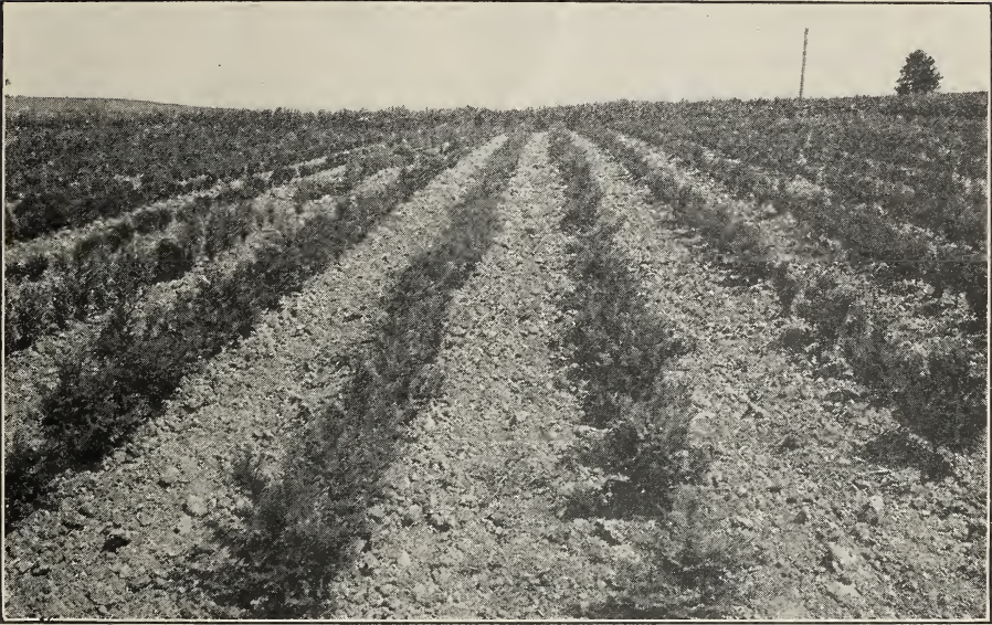
A block of our Evergreens showing Retinaspora Plumosa and Aurea (Golden) Note nice size of 18 to 24 inch and 2 to 3 ft. grades. Photographed July 10, 1924.